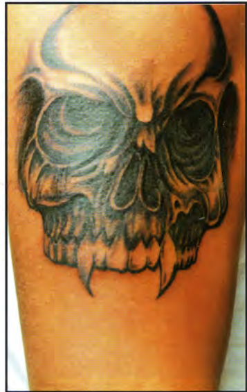
One way to endear yourself to your parents

A sign on the wall of the parlor lays down some