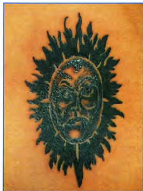
Too much beer will do this to you