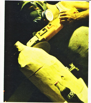
Absolute PEACE and Absolute REALITY Art Pieces Metal gas tank