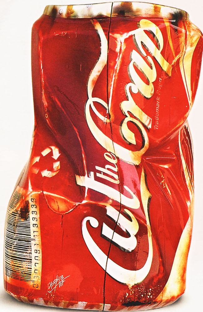
Cut the Crap Art Piece Wood | 30 x 50 cm